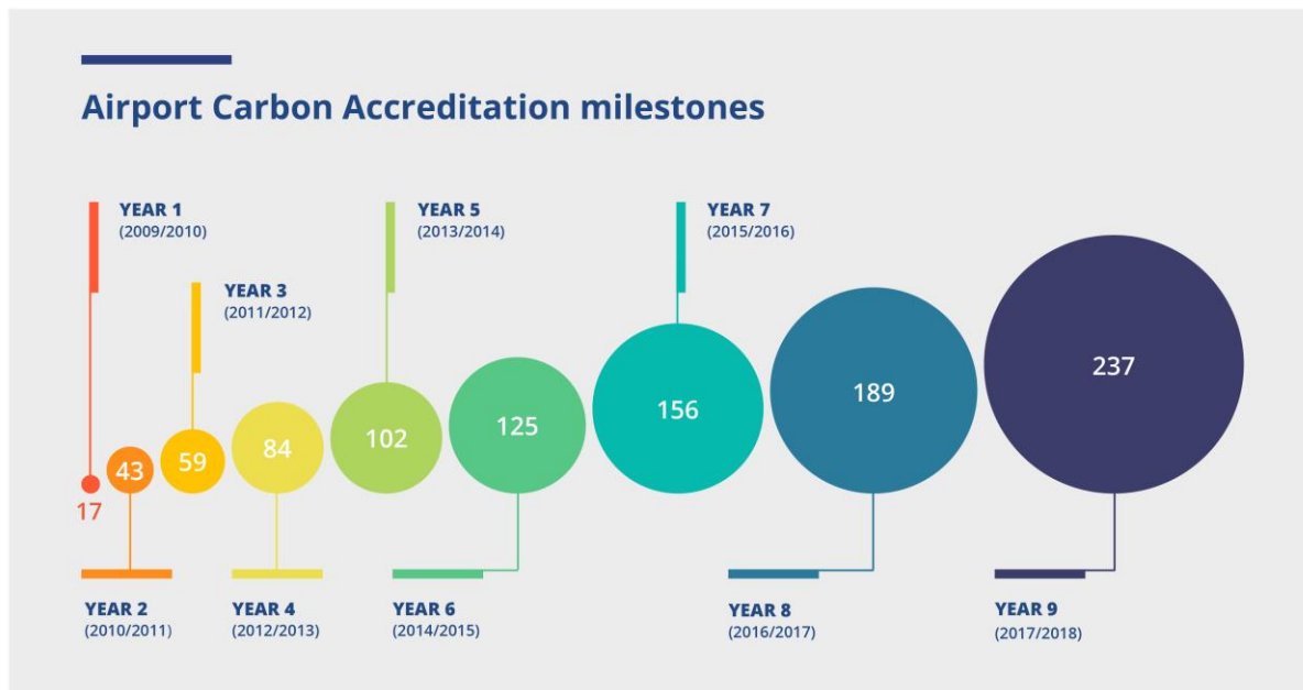
Figure 1. Airport Carbon Accredited airports over time (2010-2018)