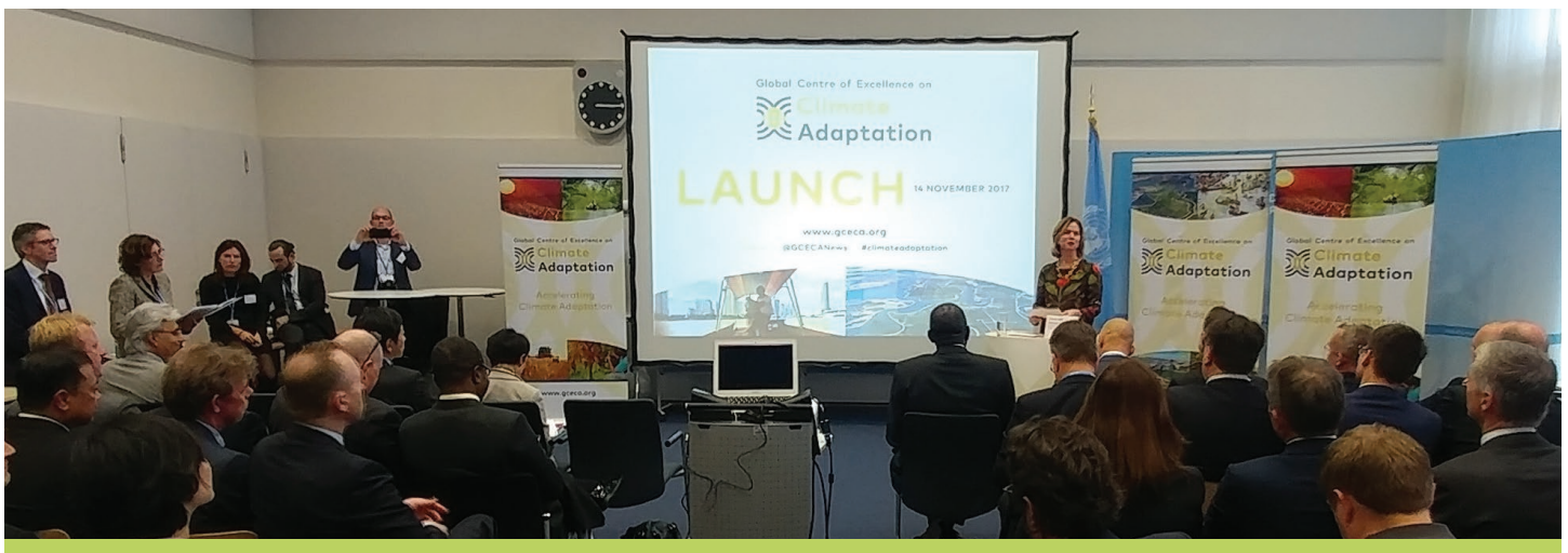
Launch Event of Global Centre of Excellence on Climate Adaptation (GCECA)

A GCECA high-level day combined discussions on resilience to climate change impacts with a focus on SDG 2 (Zero Hunger). A roundtable on the potential role of climate resilient, low emission food transport systems in achieving food security brought together these topics and demonstrated how SDG2 can be addressed through adaptation, resilience and risk-reduction responses to rural transport that also help mitigate. Transport that is sustainable, accessible and adaptive is a critical ingredient in ensuring food security and achieving