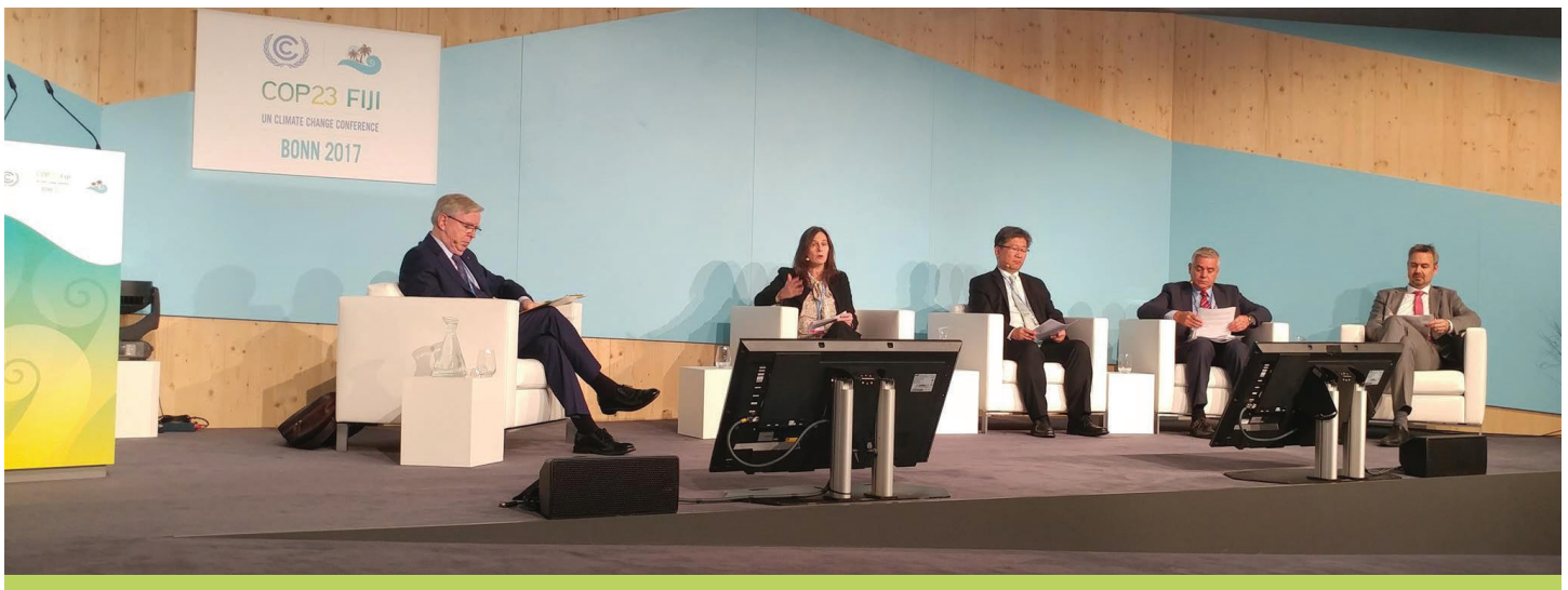
Opening of the GCA Thematic Day on Transport

Inspired by the call to action by Secretary General Ban Ki-moon in September 2014 and followed up by momentum established by the LAAA, 15 transport initiatives were developed by non-Party actors in the transport sector that were showcased during COP21 Paris. In 2017, six new transport initiatives were formed, as announced through the GCA Transport Thematic Day. There are now 21 MPGCA Transport Initiatives which include both passenger and freight transport and touch on all major transport sectors and modes. The Second Progress Report (2017) on the MPGCA Transport Initiatives: Stock-take on action toward implementation of the Paris Agreement and the 2030 Agenda on Sustainable Development was released by SLoCaT/PPMC