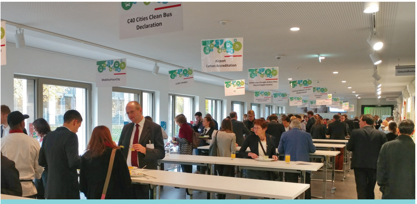
Transport Initiatives Networking Lunch during GlZ's Event on Decarbonising Transport in Germany and Abroad

where appropriate, and restructured where necessary to make real and immediate contributions to scaling up sustainable transport measures and scaling back transport sector emissions.