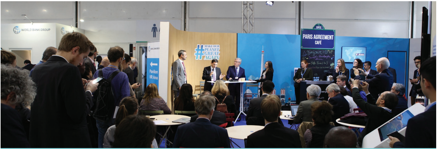
Launch of Transport Decarbonisation Alliance (TDA) at French Pavilion