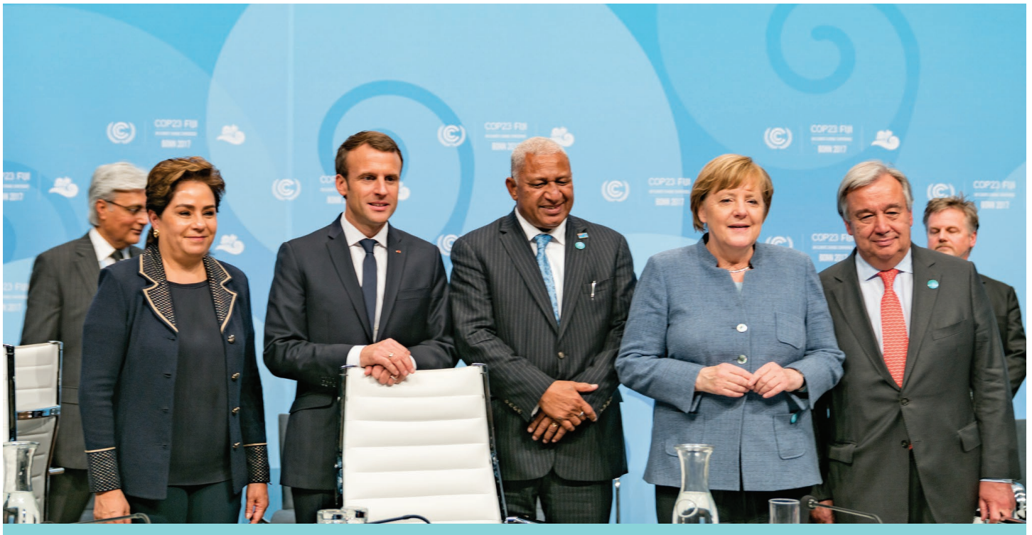
High-Level Segment of COP23 with World Leaders

The Fijian Presidency simultaneously highlighted social and ocean issues with the successful adoption of the UNFCCC Gender Action Plan, operationalization of the Local Communities and Indigenous Peoples Platform, and the launch of the Ocean Pathway Partnership. Above all was the progress of the Paris Agreement ‘rulebook’, resulting in facilitator draft texts on the Paris rules and the process for the ongoing negotiations. Party efforts will need to intensify, however – most immediately at the upcoming Bonn intersessional (April 30 - May 10, 2018) – to ensure robust rules by COP24.