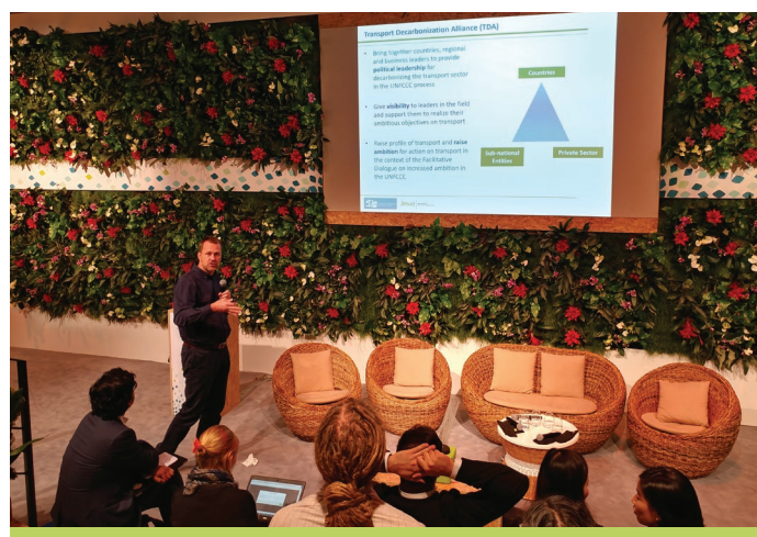
SLoCaT Senior Advisor Mark Major Speaking at Talanoa Space at COP23

The Talanoa Dialogue focus on pre-2020 action also creates opportunities for engagement of non-party stakeholders, 9 and thus creates an opportunity for the transport sector to support implementation of MPGCA transport initiatives and transport “quick-win actions” developed by the PPMC on a global scale, including support to Parties outside the UNFCCC specific meeting context, yet still crucially included in the process.