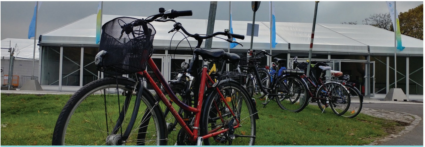
Bicycles in front of Bonn Zone of COP23. Various Mobility Options (e.g. E-Shuttle, E-Taxis, Bike-Sharing) Were Offered To Travel Between Both Zones

climate action. According to a the UN Food and Agriculture Organization (FAO), if food loss and waste were a country, it would be the third largest carbon emitter on the planet. Thus efficient, reliable, and resilient transport is essential across the food production chain: from field to village to national road; from city to port to shipping container; and in the last-mile delivery to the end consumer.