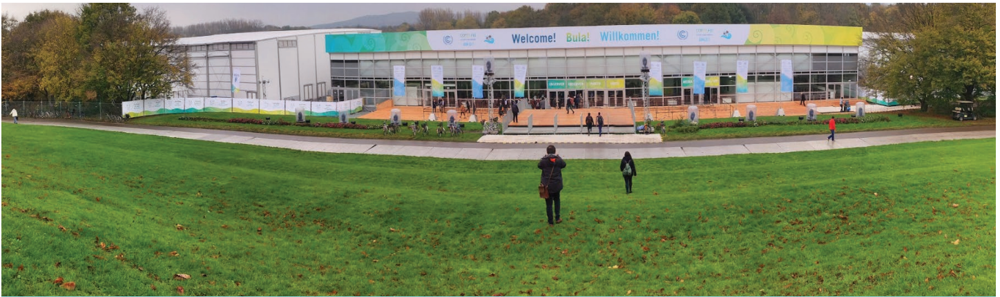
Bonn Zone of COP23 Welcomes Participants