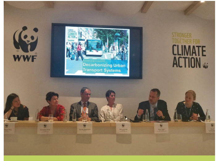
Discussion on Decarbonisation of Urban Transport Systems at WWF Pavilion

Agreement. According to the 2017 UNEP Emission Gap report released during COP23, fossil fuel subsidies in 2015 exceeded USD 300 billion, equivalent to roughly 0.4 percent of global GDP. 25 Fossil fuel subsidies were discussed during COP23 in discussion led by the Federal Ministry for the Environment, Nature Conservation, Building and Nuclear Safety (BMUB) and the Federal Ministry for Economic Affairs and Energy (BMWi), to advance facilitative approaches and national reform efforts in developed and developing countries, as an area ripe for international cooperation.