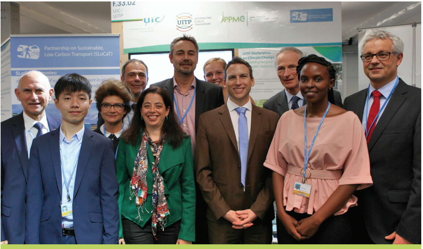
The PPMC Team With Representatives from SLoCaT Partnership and Movin'On