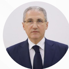
HE Mukhtar Babayev President-Designate of COP29