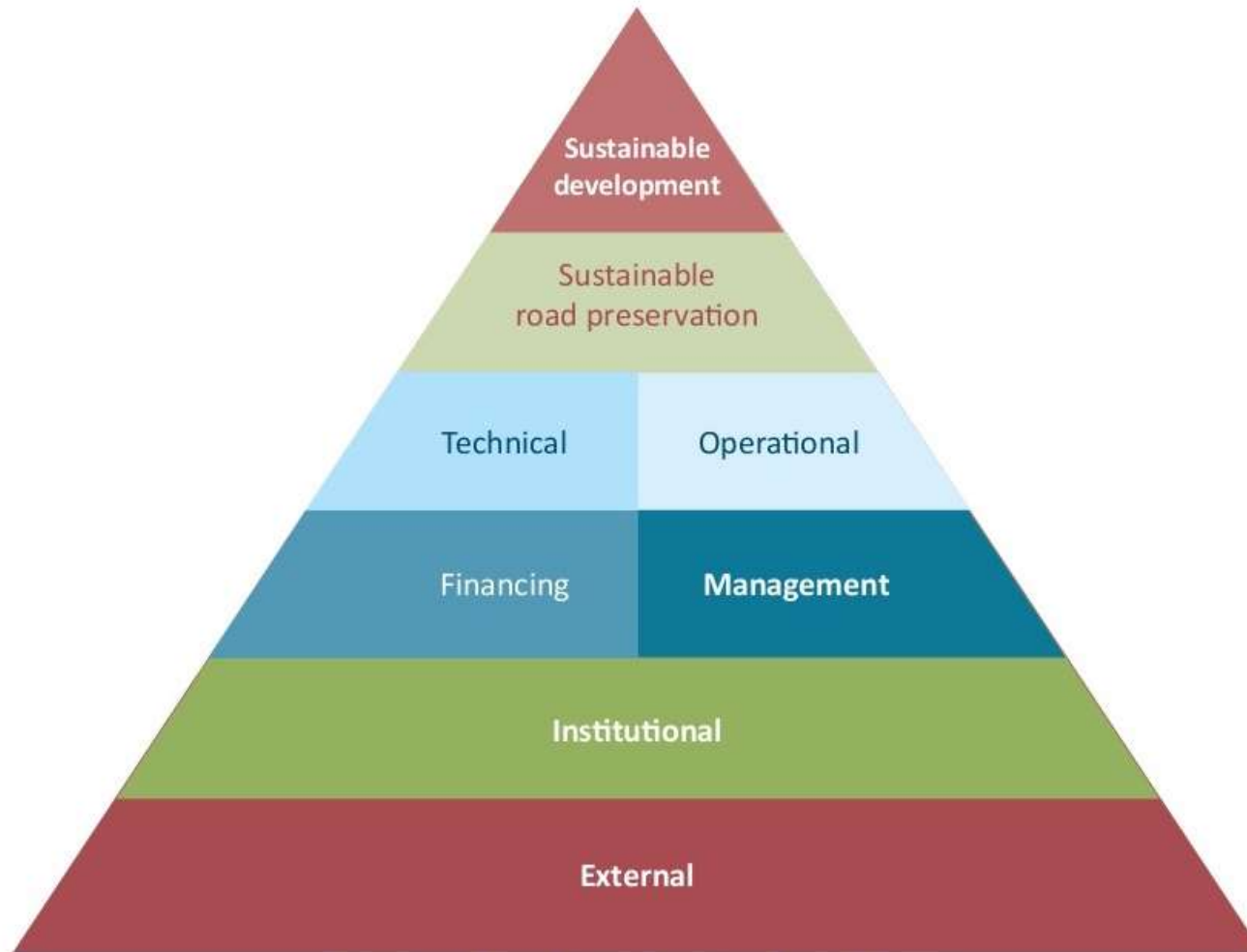
ROAD PRESERVATION PYRAMID